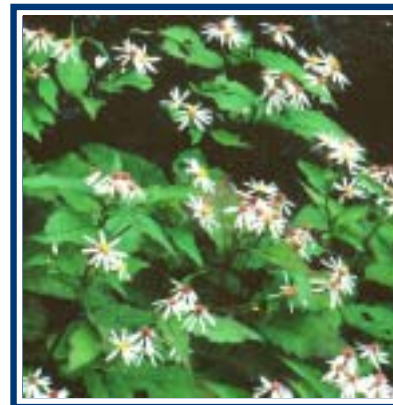
white wood aster

Across the southern slopes is a heath bald shrub community. Carolina rhododendron dominates these clusters of shrubs, which includes two highly fragrant plants: smooth clammy azalea.