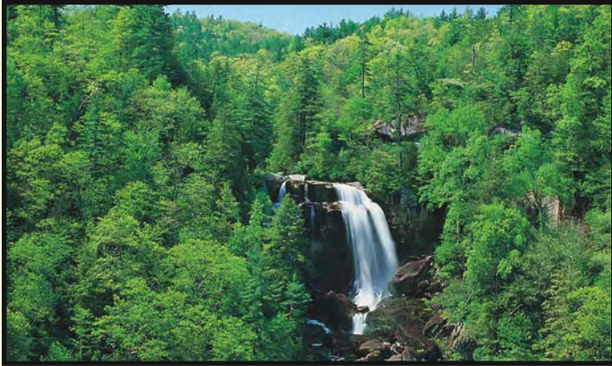
Whitewater Falls plunges over the Blue Ridge Escarpment.