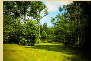
10. Rock Garden & Lower Meadow