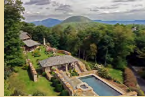
4. Pool Pavilion, Heated Pool & Spa