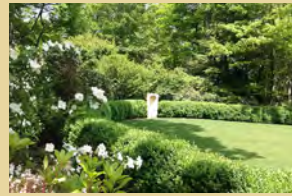
5. Croquet Court