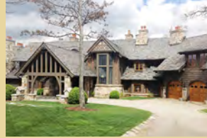
1. Main House with Dining Pavilion