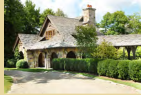
2. Guest House