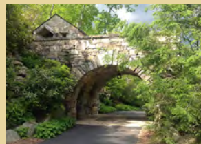
8. Native Stone Overlook