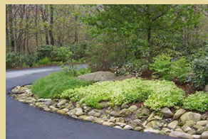
9. Landscaped Entry Drive (1/3 Mile)