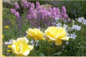
3. Cutting, Herb & Vegetable Gardens