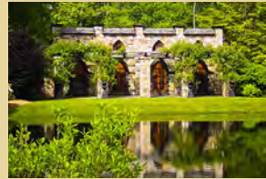
12. Pond House/Equipment Building with Property Manager Office