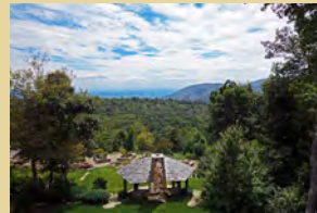
6. Roundel Viewing Pavilion with Fireplace