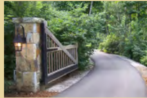
7. Main Entrance Gate